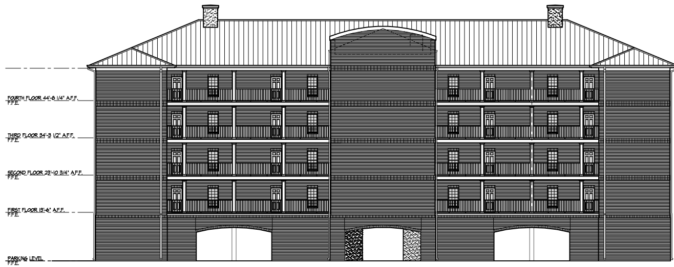
NORTH ELEVATION SCALE: 1/8" = 1'-0"